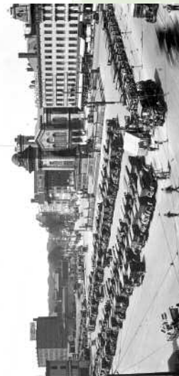
Syracuse's Clinton Square shortly after the Erie Canal was removed, c1926