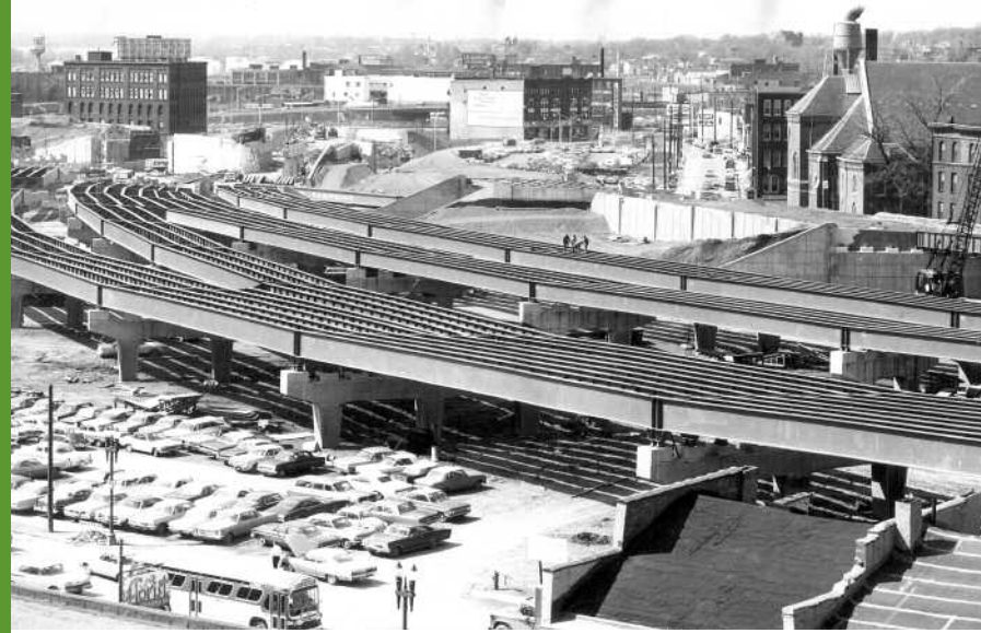
Construction of the Interstate 81 and Route 690 interchange in Syracuse, 1967

Those who wish off-campus lodging must make their own reservations. A block of rooms is being held until May 10 at the Genesee Grande Hotel, 1060 East Genesee Street at University Avenue; the rate is $76 per room, single or double. You must call them direct at (800) 365-HOME or (315) 476-4212. Rooms may be available after the cut-off date but the availability and rate are not guaranteed after that date. For Friday sessions, those staying off-campus may park at the Irving Garage on Irving Avenue. Tell the attendant you are with the Conference on NYS History. For Saturday sessions, you may park on-campus.