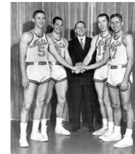
A portion of the Syracuse Nationals team, NBA champions in 1956, c1955