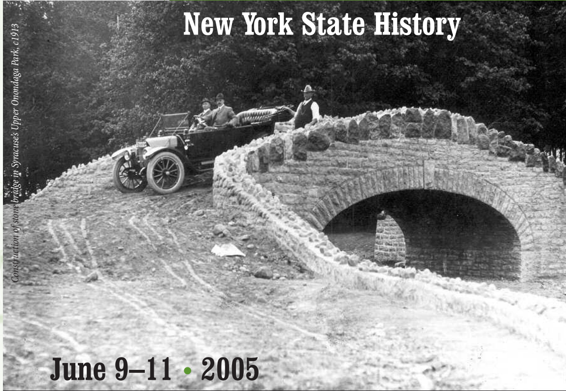
Construction of stone bridge in Syracuse's Upper Onondaga Park, c1913