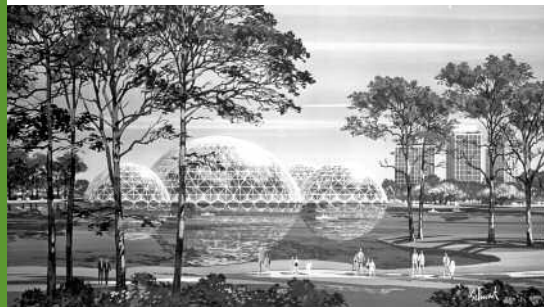
An urban renewal vision of downtown bio-spheres for Syracuse's Onondaga Creek, 1965